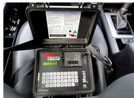
Tester secured into best testing position on passenger seat.

AutoTest Products Pty Ltd 63 Parsons Street, Kensington, VIC 3031 Australia tel +613 8840 3000 sales@autotest.net.au