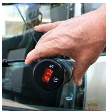
Step 2 – Activate