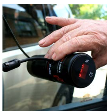
Step 3 – Read