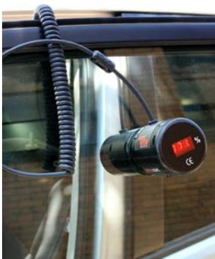
Step 1 – Align

Repeat steps for each window area to be tested.