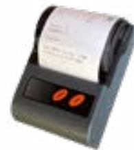
Optional Feature to Buy : Bluetooth Printer

Note: Outer appearance and specifications are subject to change without prior notice.